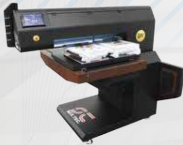
Eagle TX 50