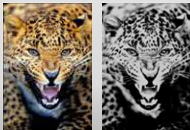
Optimized whitebase generation

The template function allow to virtually split the table in smaller area named 'panels' to print with a precise and constant positioning. You can easily fill all the panels with the desired images and positions reducing time for preparation of the graphics and reducing wastes of ink and materials due to poor positioning and positioning tests.