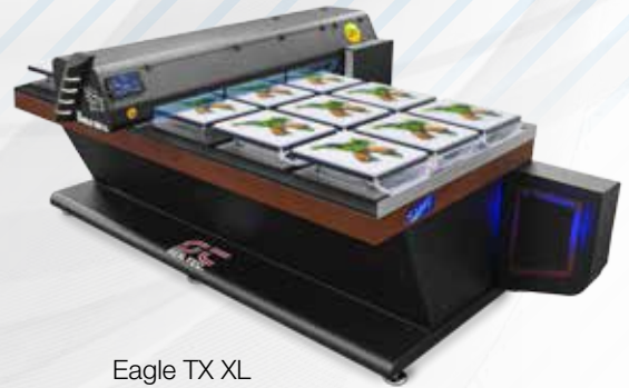
Eagle TX XL