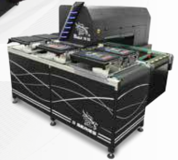
Classic line 1 or 2 printheads