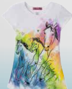
T - shirts