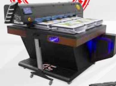
Automation From 2 to 4 printheads