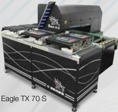
Eagle TX 70 S