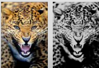
Optimized whitebase generation

The template function allow to virtually split the table in smaller area named 'panels' to print with a precise and constant positioning. You can easily fill all the panels with the desired images and positions reducing time for preparation of the graphics and reducing wastes of ink and materials due to poor positioning and positioning tests.