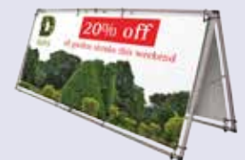
Banners, advertising displays